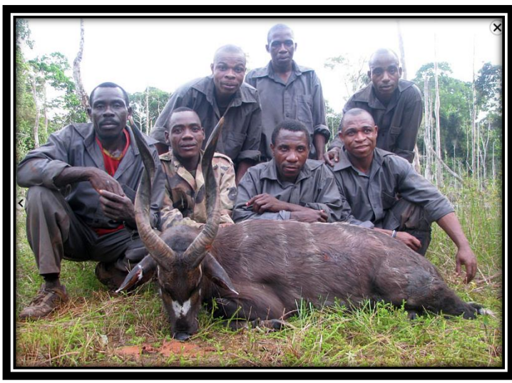
Page 4, Revised 8-10-14